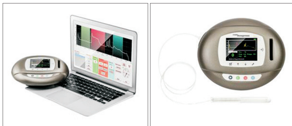
Figure 1. The Anopress device is shown here with a laptop computer and a solid state catheter connected. Bluetooth technology allows the Anopress device to work wirelessly.

The procedure was performed by an experienced physician with a specialist interest in anorectal manometry and physiology. All subjects were instructed to defecate if required prior to the procedure and no bowel preparation was given. It was confirmed that all subjects understood the commands squeeze, cough, and push prior to the procedure. 17,18 Both genders were included in the study and the female cohort was subcategorized into nulliparous and parous groups. Anal resting, voluntary, involuntary, endurance, and strain pressures were determined by following the study protocol (Fig. 2). The data generated by the procedure were automatically recorded and immediately available for review. All the values expressed by Anopress are summarized in Table 1. A VAS score with the descriptor extremes "0 = no pain at all" and "10 = my pain is as